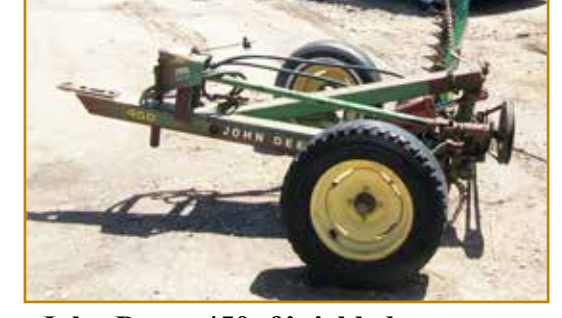
John Deere 450 -9' sickle bar mower, PTO dr, Hyd lift, draw bar pull, on rubber