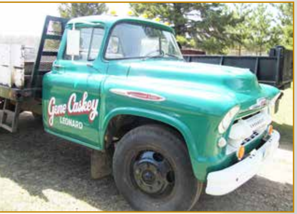
'57 Chevy 6500 2 ton restored, shows 39,958 mi, 261 6 cyl, 4+2 spd, 18' hoist bed.

build on 350 w/4 bolt main, turbo 350 trans.