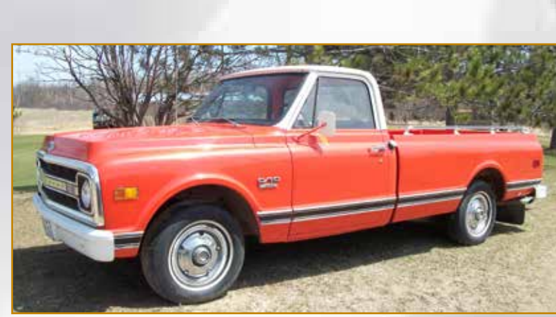
'70 Chevy <sup>1</sup>/<sub>2</sub> ton 2 wd Auto, 7000 miles since total re-

'31 Model A Ford restored, shows 83,000.