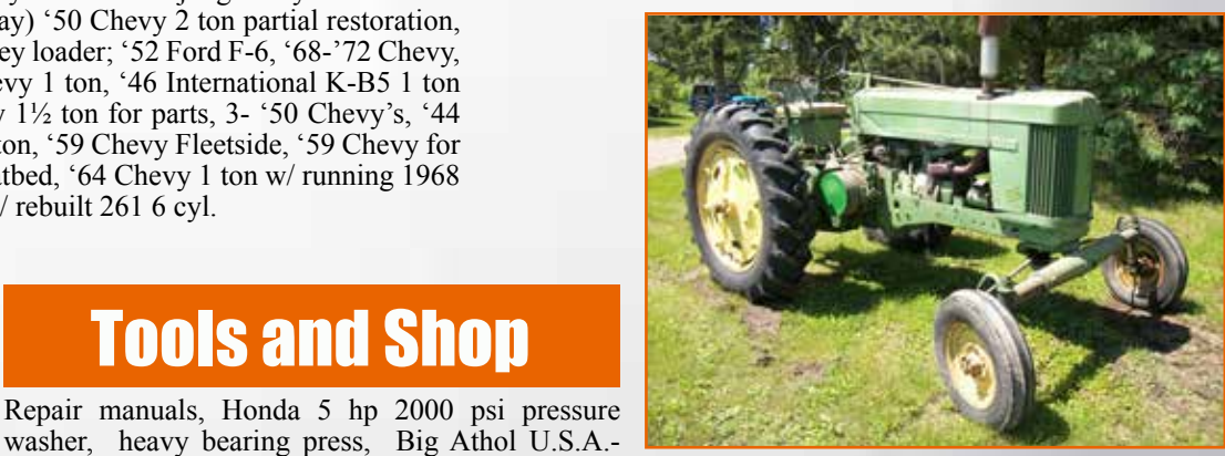
John Deere 60 wide front Gas eng, made shop vise, stand mounted bench grinder, asst combo wrenches, three big tool chests loaded w/propower steering, live 540 PTO, belt fessional grade tools, wall mount organizer, electric pulley, sngl hydraulics, 13.6-38 rears impact wrench, hose clamp assortment & display, mechanic's creepers, bench grinder, ITT 16 spd drill -- one new, reads 7200 hours press, wall mount parts cabinets, free standing parts Ser # 6002219 cabinet, welding table w/vise, Blacksmith's anvil,