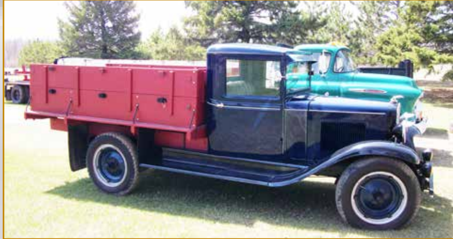
'31 Chevy 1 ton restored, 216 6cyl, 4 spd.