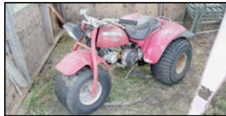
Honda ATC 90 3 wheeler