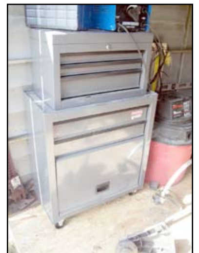
Craftsman rolling tool cabinet

A quantity of household and kitchen goods, Kenmore washer and dryer, 1 yr old, window Air conditioner, Queen size bed, dressers, TV's, Hoover steam vac, dining table, refrigerator/freezer, Sanyo microwave, china hutch, Stairglider exerciser, Necchi sewing machine, folding poly table,