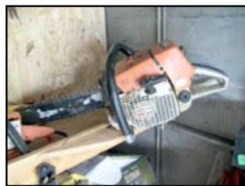
Stihl 311 Magnum chainsaw