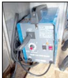
Chicago electric 90 amp flux wire welder