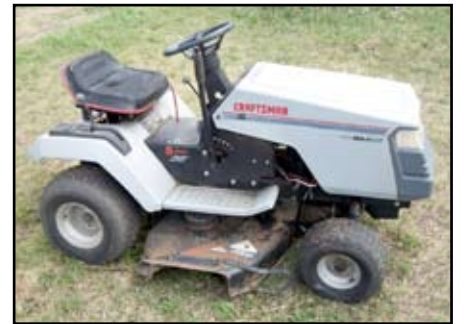
Craftsman 12.5 hp 38" riding mower