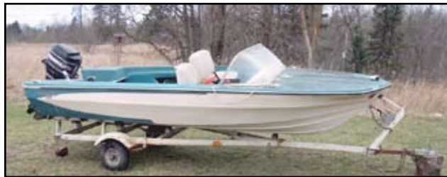
1966 15' Glastron boat, w/Merc 50hp and trailer