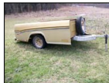
Approx 1965 Dodge pickup box trailer