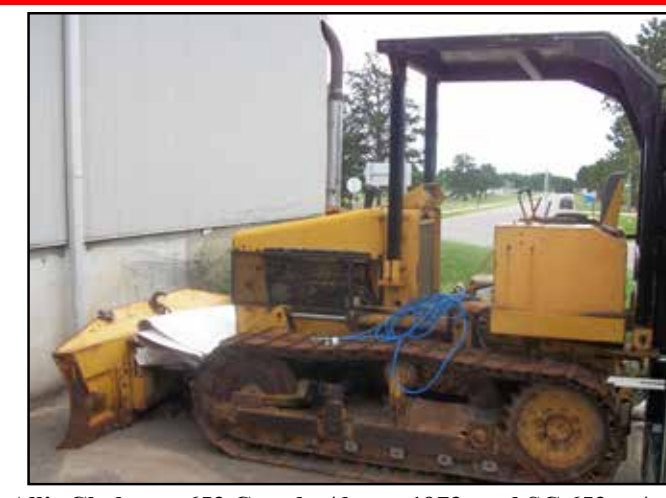
Allis Chalmers 653 Crawler/dozer, 1973 mod SC 653 w/