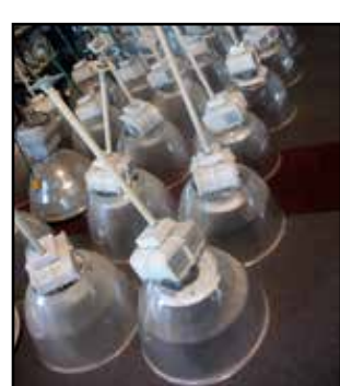
400 watt Hi Bay hanging light fixtures New they are over $ 400.00 apiece