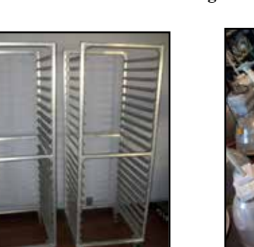
Semi load of "New Age Industrial" aluminum 20