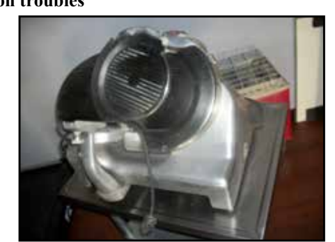
US Berkel Meat slicer mod 808-120v