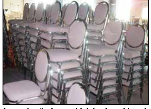
Lavender & chrome high back cushioned