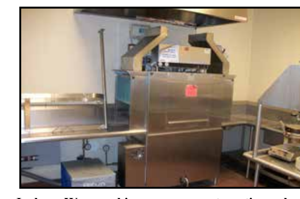
Jackson Warewashing conveyor automatic washer, AJX 44. Natural gas, w/Captive Aire 6' Stainless hood w/Hatco mod c-45 water booster. Paid over $25,000 new, hardly used capacity of over 200 trays per hour. (buyer removal)