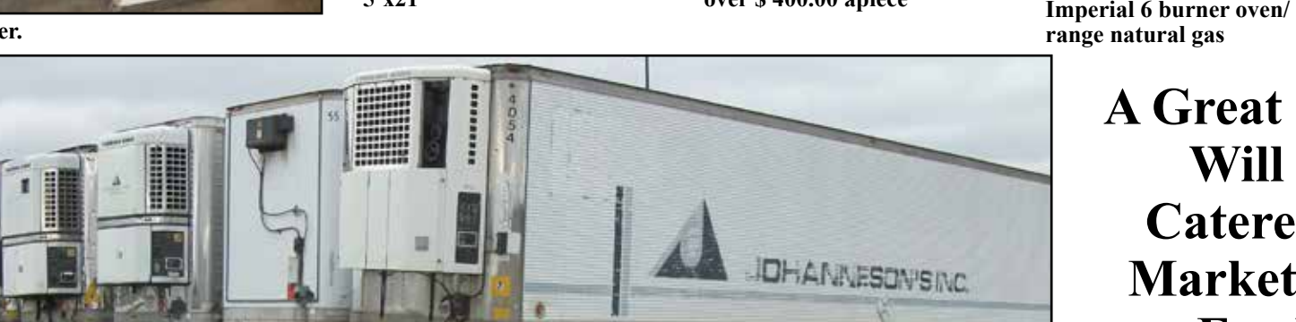
Approx ½ doz 48' semi van body trailers will be sold. Good for storage