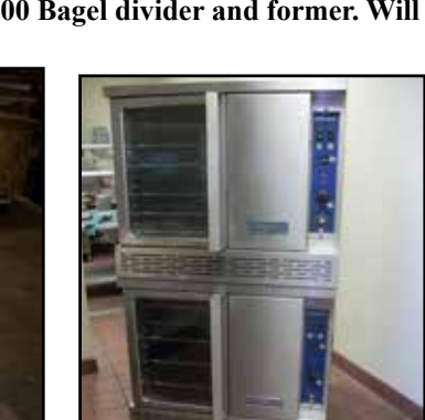
Imperial ICVD dual Tur-Rondo Mod MB bun dividbo flow convection oven. Bakery depth. 140k btu Natural gas