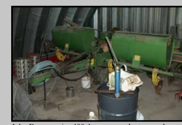
John Deere series 400 4-row corn planter, marker wheels, rubber press wheels, clean boxes