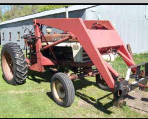
1959 IH 560 Diesel tractor w/ Heavy duty loader & bucket, fair 15.5-38 rubber, m wheel weights, 3pt, PTO drive hyd pump, dual hyd, belly pump works, ser # 17902