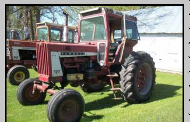
1966 IH 806 w/ cab, diesel, 3pt, fair 18.4-38 rears, 540/1000 PTO's, single hyd, ser # 34165S