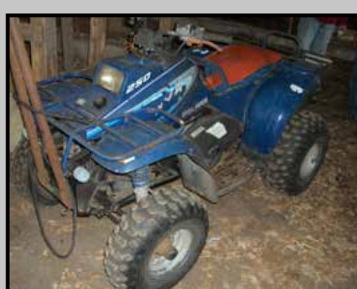
1993 Polaris 250 4X4 wheeler runs good