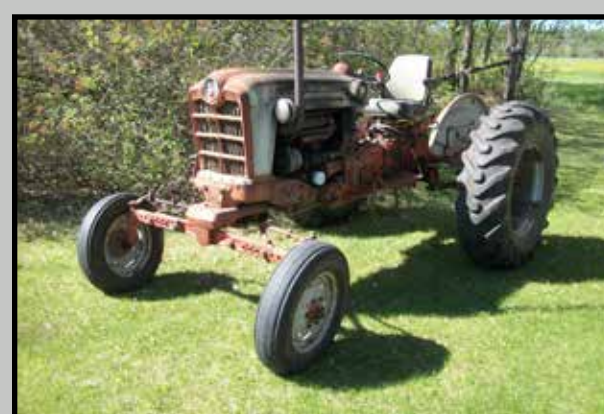
1958 Ford 841 PowerMaster gas tractor, fair 16.9-28 rears, single hyd, 3pt, ser # 30747