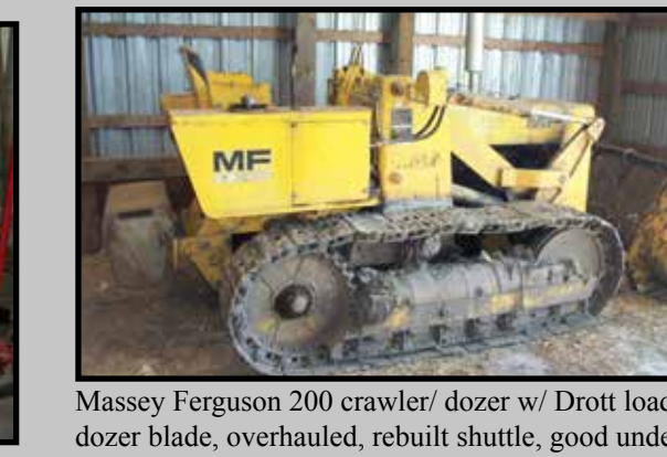
Massey Ferguson 200 crawler/ dozer w/ Drott loader/ dozer blade, overhauled, rebuilt shuttle, good under-carriage, runs good, 3 cyl Perkins diesel, approx 40 hp, suitcase weights