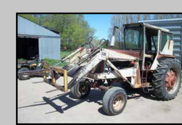
1967 IH 656 gas tractor w/ cab & GB loader, bale spear, single hyd, 3 pt, very good 15.5-38 rears ser # 21531S