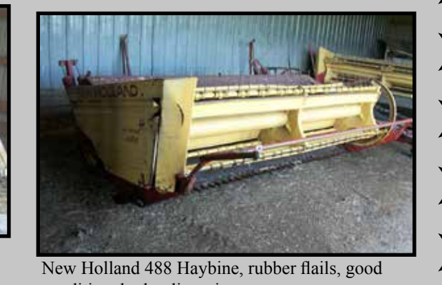
New Holland 488 Haybine, rubber flails, good condition, hydraulic swing