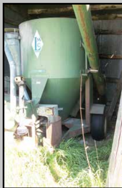
Lorenz mod 1600 mixer grinder

Terms: Cash or check, no cards, all items to be settled for day of sale. Buyer responsible for their purchases, all items sold as/is, no warranties. Statements by auction company on sale day take precedent over all other matter. We are not responsible for accidents, errors, or omissions.