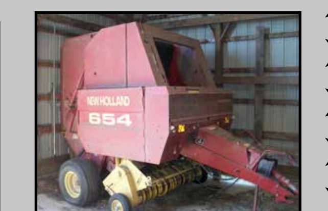
NH 654 round baler, good condition w/book