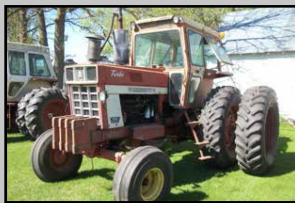
1974 IH 1066 Turbo Diesel tractor w/cab, suitcase weights, 3 pt, fair 18.4-38 hub duals, wheel weights, dual hyd, 540/1000 PTO, 3pt. ser # 2510175U022492