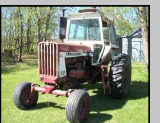
1965 IH 806 Diesel tractor, fair 18.4-34 rears, single hyd, 3 pt, 540/1000 PTO ser # 17595S-Y