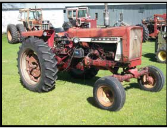
1967 IH 656 Diesel Tractor, Very good 15.5-38 rubber, wheel weights, 3 pt dual hyd ser #26826