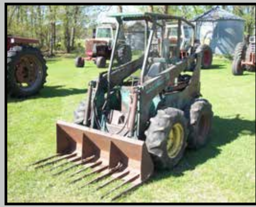
Mighty Mac Skidsteer loader w/ rebuilt Ford 4 cyl gas engine, fair 9.5-16 rubber w/ quicktach bucket