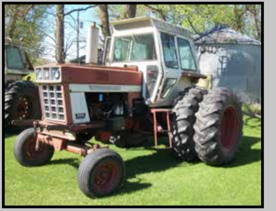
1973 IH 966 diesel tractor w/cab, dual 18.4-34 rubber, 3pt, single hyd, 540/1000 PTO ser # 2510175U022492