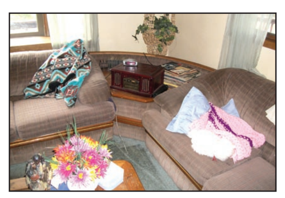
5 piece living room set

The most incredible "Hornets" nest, Makes a wonderful decoration.