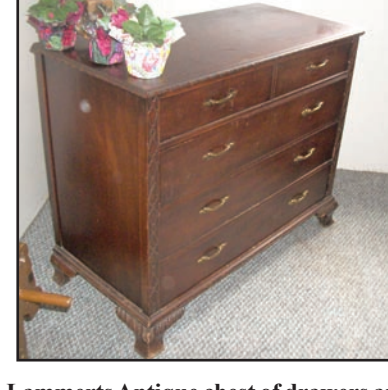
Lammerts Antique chest of drawers and matching bed approx 100 years

The most incredible "Hornets" nest, Makes a wonderful decoration.