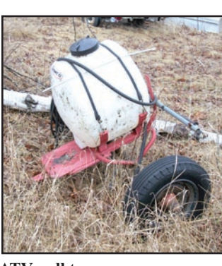
ATV pull type sprayer approx 50 gal