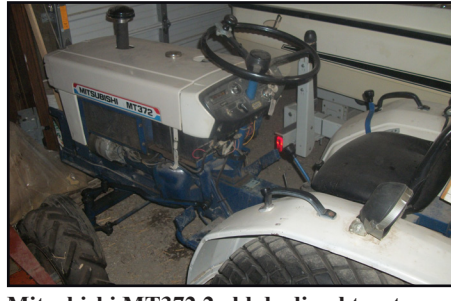
Mitsubishi MT372 2whl dr diesel tractor 3pt, rear PTO, front pulleys, 3spd dual range trans, 3 spd PTO, w/ 4' front mounted snow blower 216 hrs, clean