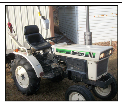
Bolens/Iseki G152 2 whl dr diesel tractor 15 hp 6 spd ser # 5369, front and rear PTO's new rubber 650 hrs 3 spd PTO 3pt dual range trans w/ ROPS

asst lumber, approx 60- 6' wooden fence posts, some treated, approx 150- 8' oak 2"x4"s rough sawn, approx doz treated 2x8 - 8