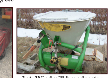
3pt Windmill broadcaster