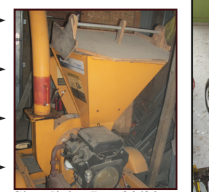
Simplicity Pro 20/20 chipper shredder trailer mounted w/ Kohler Command 20, will handle up to 1" sticks