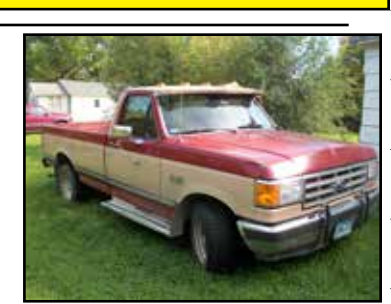
1987 Ford F150 2wd Pickup, 147k auto., 5.0 ltr V8